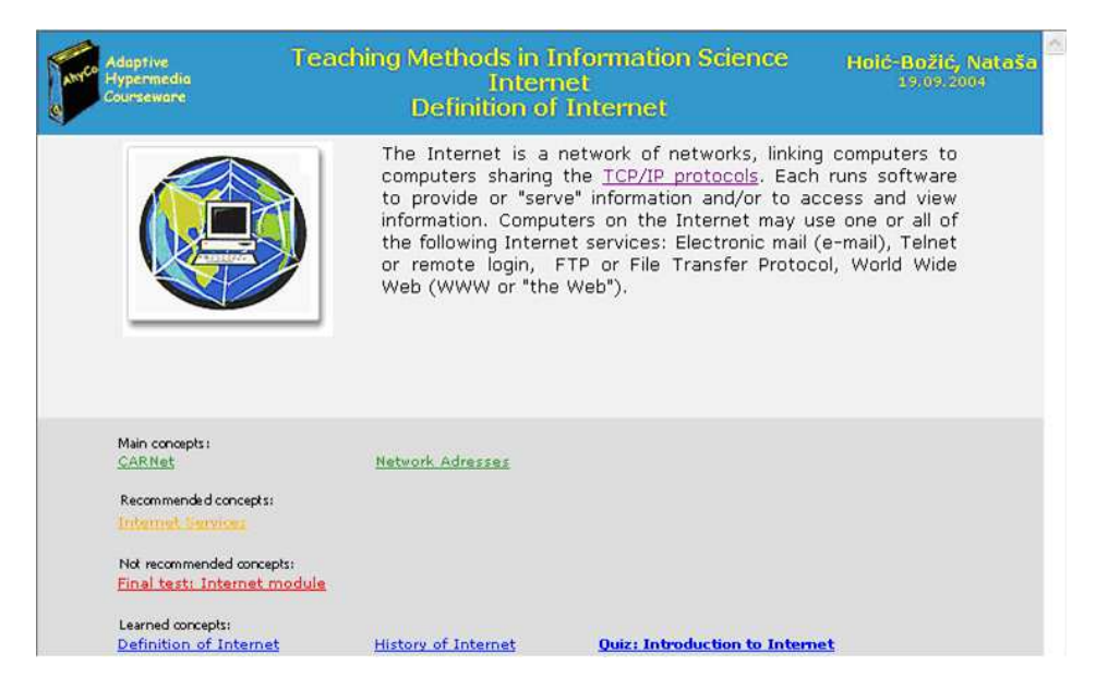
Fig. 2. The page with the content of a lesson